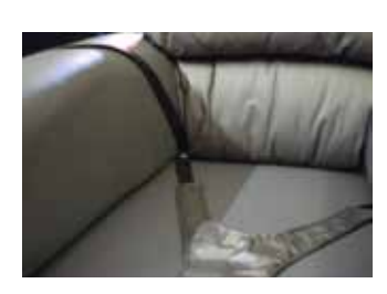
Place the ends of the straps over the arms of the chair ready for the occupant to transfer to the chair.

Sit the occupant into the chair with their pelvis firmly back in the seat and their buttocks on the back edge of the Pelvic Positioner.